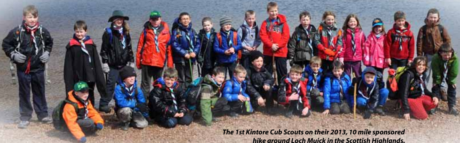
The 1st Kintore Cub Scouts on their 2013, 10 mile sponsored hike around Loch Muick in the Scottish Highlands.

Over the years the annual hike has expanded and has also involved members of their Beaver colony Scout Troop and leaders desperate to get their prized South Africa badge.